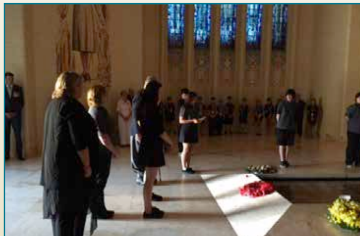
Laying a wreath at the War Memorial in Canberra